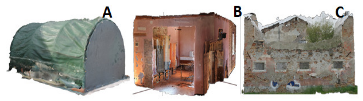
Fig. 3. Example of frame collection processrespectively for farm equipment shed (A), point of sale in farm wine cellar (B) and ruined farmhouse building (C)