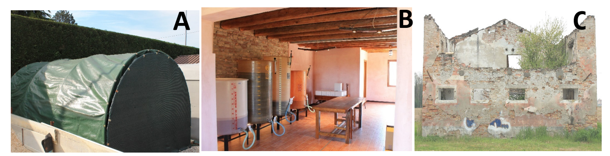
Fig. 1. Farm equipment shed (A), point of sale in farm wine cellar (B) and ruined farmhouse building (C)